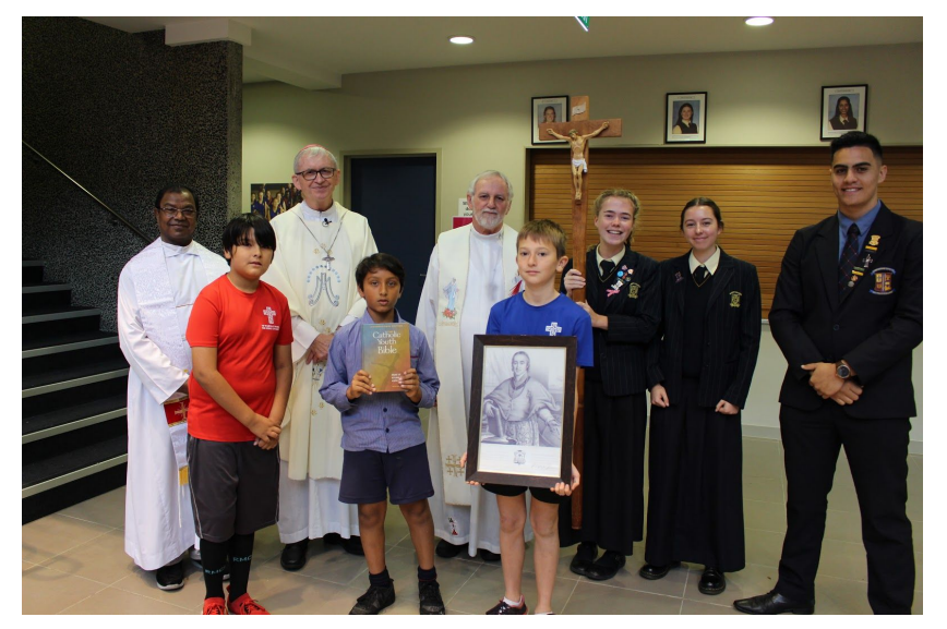
Over 1200 people celebrated mass