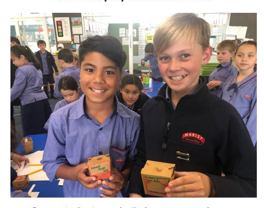
Some students made their own prayer boxes