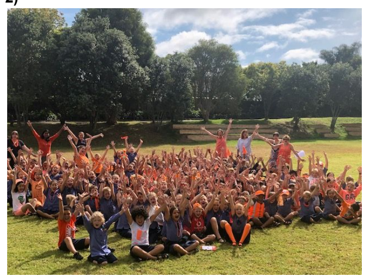
We raised $311.90 which has been donated to the Shine Foundation to support the 'Light it up Orange' campaign.

are supporting them. Would you like it if you were split up from your parents? Cassidy Parke (Year 2)