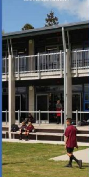
Liston College, Henderson