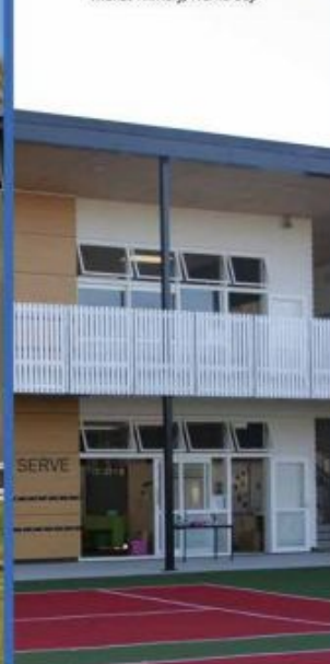
Marist Primary, Herne Bay