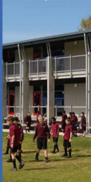
Liston College, Henderson